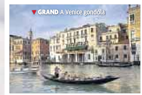
▼ GRAND A Venice gondola

Travelling around the waterways, and from Venice