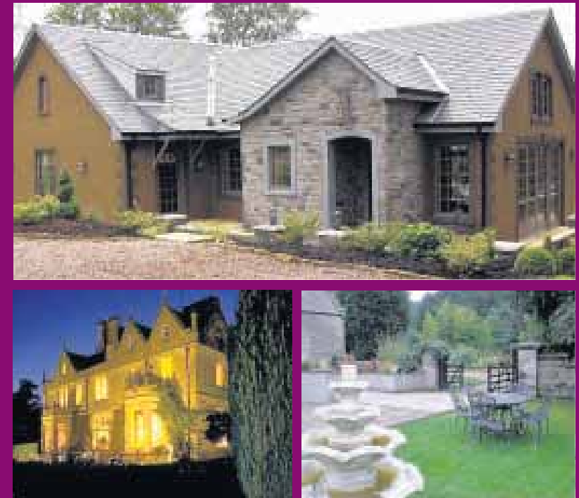
▲ SUPERB The luxurious Craigsanquhar House is the perfect place to relax and unwind